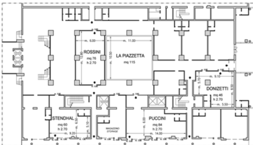
Piano -1 / Basement